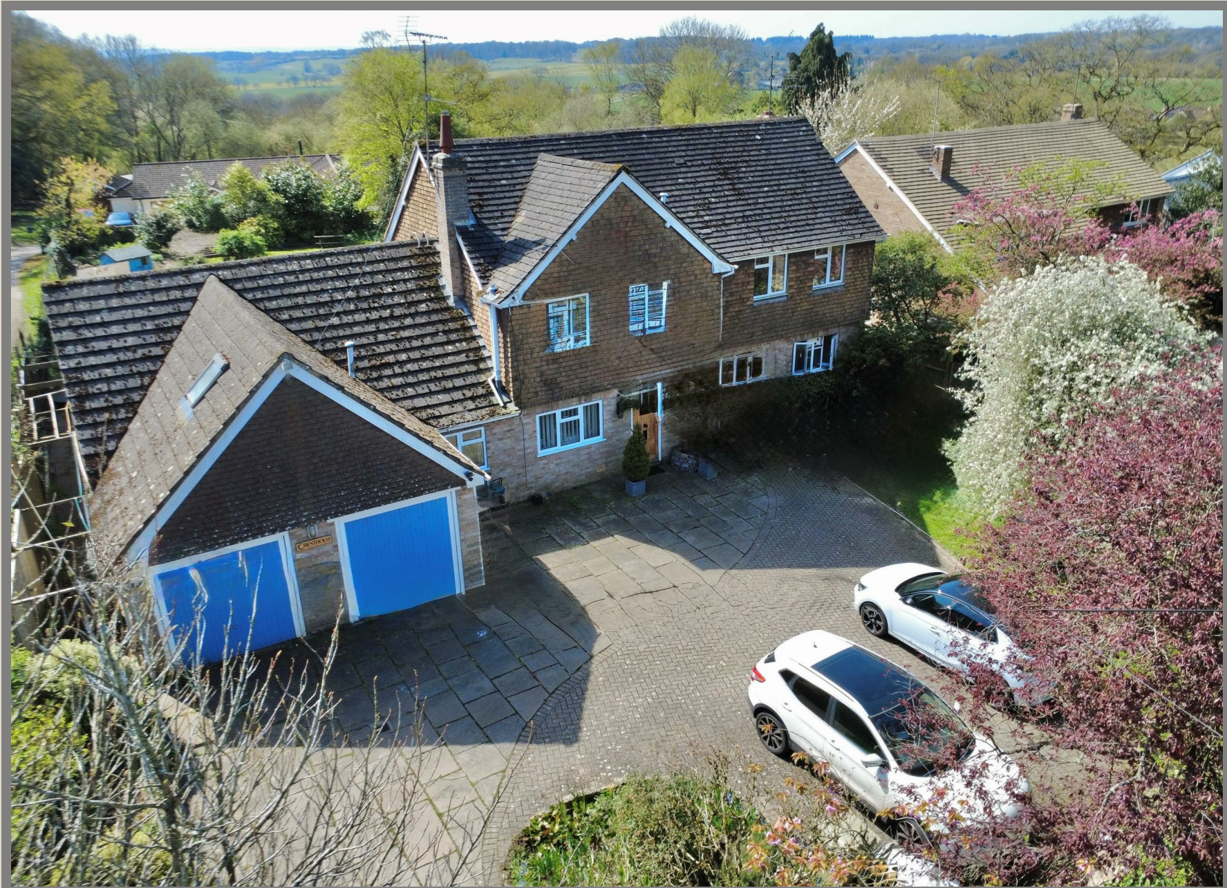
Crestholm, Red Shute Hill, Hermitage, RG18 9QH